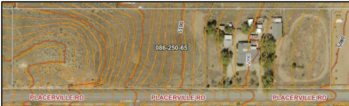
Figure 1. Topography Map

The subject parcel is developed and is relatively flat with portions of the parcel containing slopes between 5% and 10% as indicated in Figure 1 below.