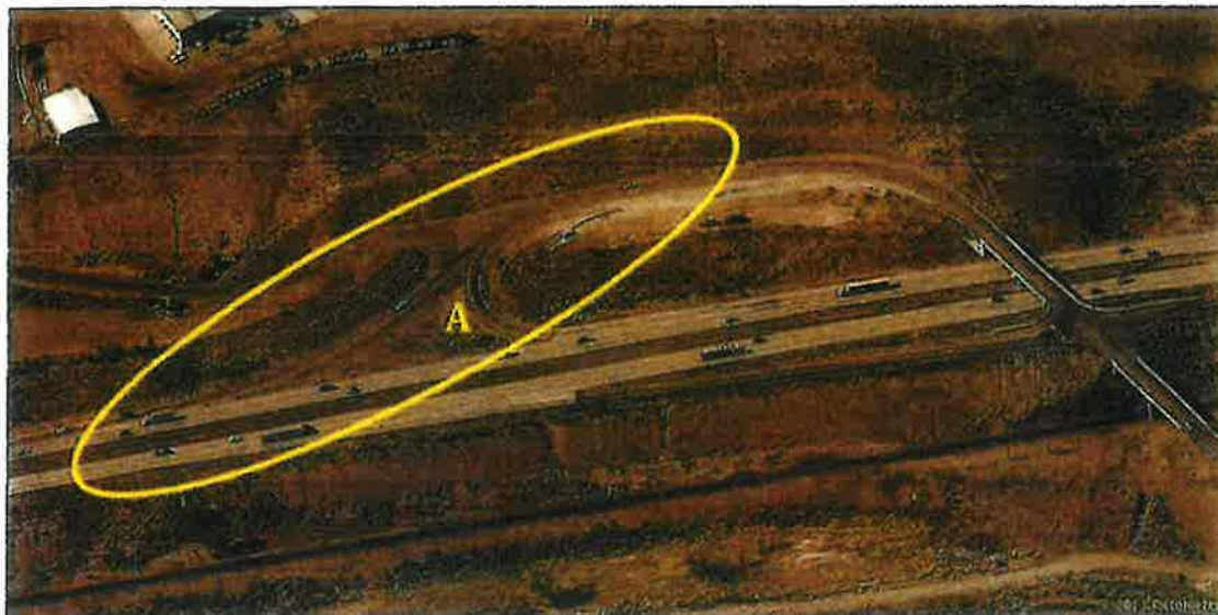
Figure 3.4-32: The images depict the existing infrastructure connecting Lockwood to Interstate 80. The image illustrates an on-ramp with substandard length for safe entry onto the interstate (A), and sharp and narrow curvature which inhibits safe two-way vehicle and truck travel (B).