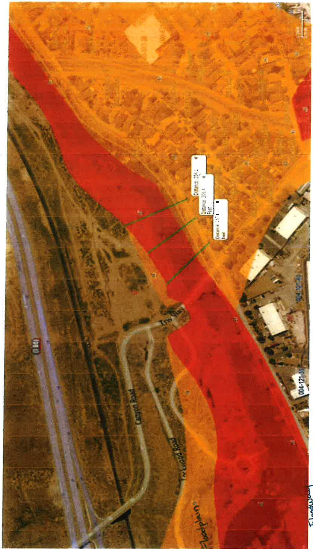
The above map shows the existing single family residential neighborhood of Rainbow Bend located approximately 300-350 feet from the proposed industrial zoning area. The surrounding area is the Truckee River.