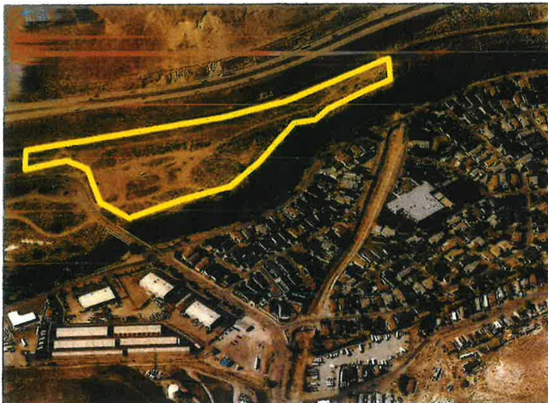
Figure 3.4-35: Adjacent vacant land north of the Truckee River in Lockwood. The image above shows vacant land in Washoe County that may be considered for transfer into Storey County.