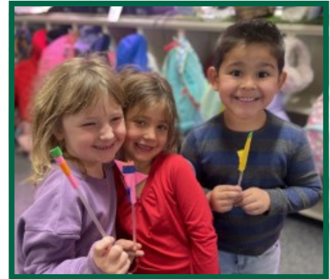
Above: Kindergarteners enjoy a 4-H in-school lesson on straw rockets. They learned principles of engineering and forces.

"My students really enjoyed the hands-on learning. It's great to have them use their problem-solving skills as well!" - WCSD Teacher