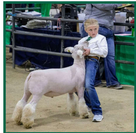
Above: A 4-H member poses with her sheep.