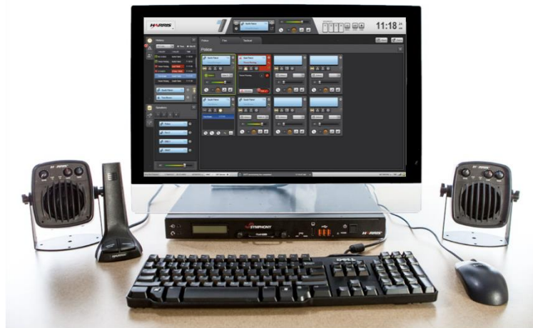
Figure 1. Symphony Dispatch Console and Accessories

A single, logical network connection to a PC replaces the traditional audio switches found in traditional systems. With less equipment and complexity, the Symphony Console is a more robust solution. The core package of the Symphony includes a Central Processing Unit (CPU), monitor, microphone, mouse, and speakers, which can be placed on any standard furniture that has space to accommodate a monitor and the accessories shown in Figure 1. A 23" HD monitor is being offered with this proposal. The SDP also supports a complete set of audio accessories, including headsets, microphones, speakers and footswitches. The SDP's industrial grade computer runs the Windows 10 operating system, and hosts the Symphony application, which provides the dispatch features with a highly customizable graphical user interface. Our recently approved NSRS migration plan will allow the Symphony consoles proposed to work on the existing EDACS network then on the new P25 Phase 2 system provided they are placed into service after the August 2021 migration.