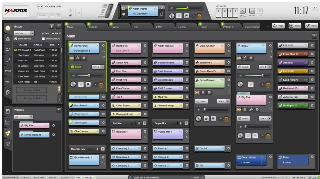
Figure 2. User Display Symphony Dispatch Console

A communication module is the fundamental component for communicating through the console. Each communication module can be individually programmed with a single entity, representing a talk group, a radio unit, a conventional channel, or another console. When an entity is programmed into a module, all audio related to that entity is routed to the console. Modules provide incoming call monitoring and outgoing console-originated call transmissions. On the display screen, rectangular boxes represent the modules. Up to 1,024 communication modules can exist across eight pages of the display.