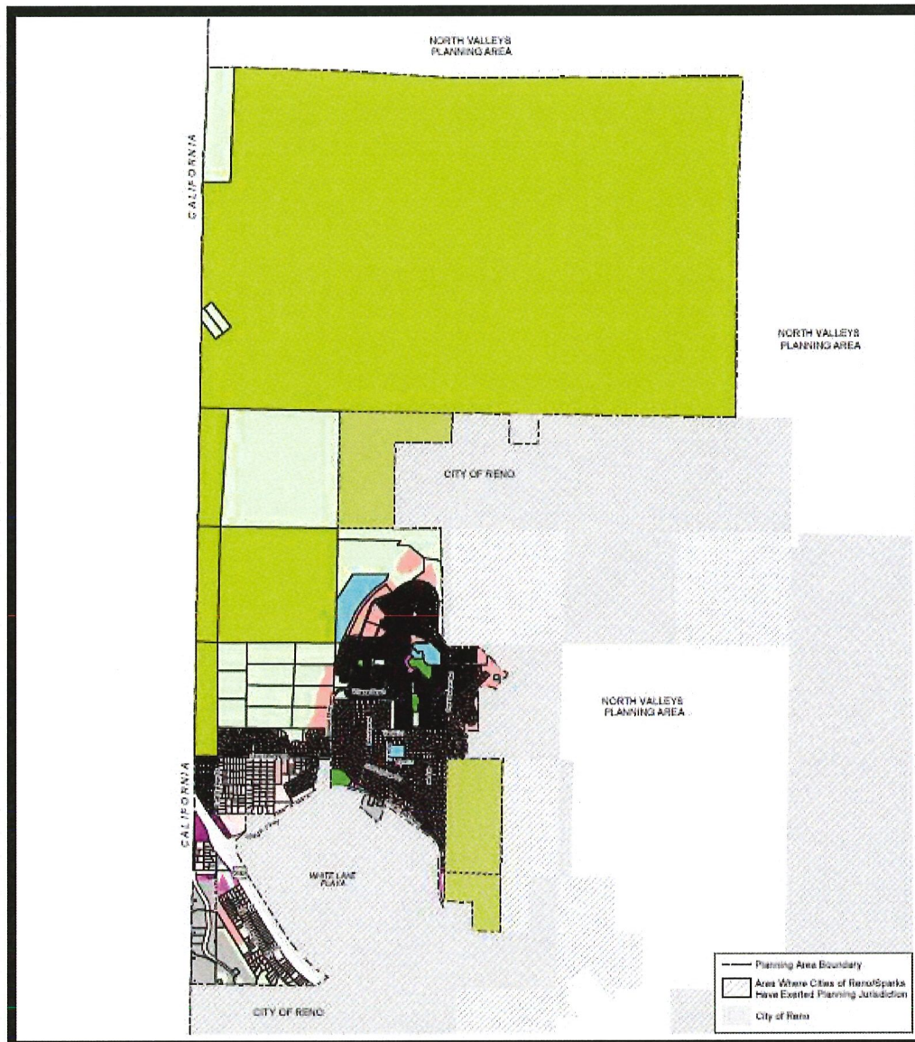
Exhibit A, WRZA19-0006