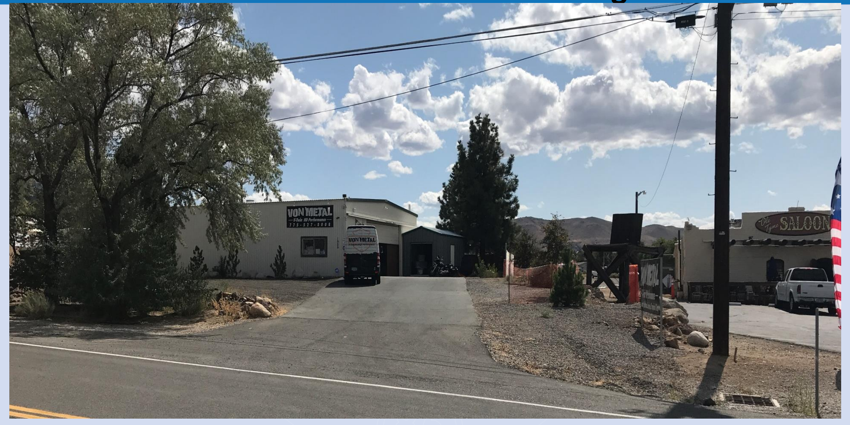
Board of County Commissioners January 14, 2020