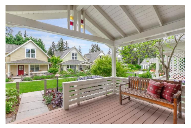
Figure 2: Example Cottage Court

New housing types added to the residential use types table include triplex. quadplex, cottage courts, employee housing, guest quarters, and minor accessory dwelling units (which are already provided for in code but are not in the table). Triplex and quadplex contain three and buildings four dwelling units on one parcel respectively. The cottage court use type is a housing development that contains between two (2) and twelve (12) smallscale single family detached dwellings