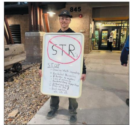
PROVIDED / ALEX TSIGDINOS