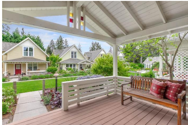
Figure 2: Example Cottage Court

New housing types added to the residential use types table include triplex, quadplex, cottage courts, employee housing, guest quarters, and minor accessory dwelling units (which are already provided for in code but are not in the table). Triplex and quadplex buildings contain three and four dwelling units on one parcel, respectively. The cottage court use type is a housing development that contains between two (2) and twelve (12) small-scale single family detached dwellings