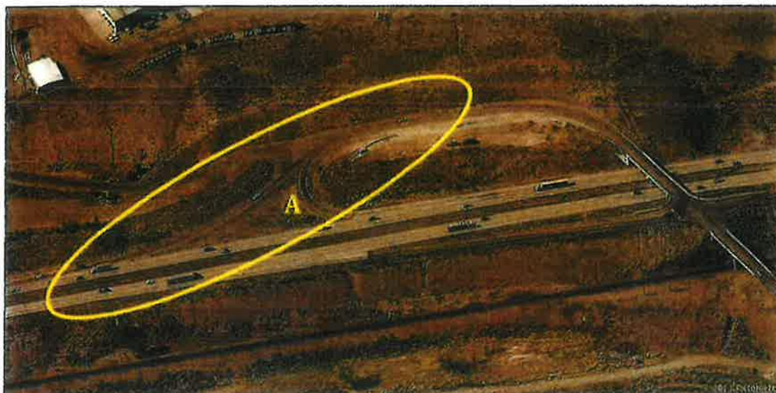
Figure 3.4-32: The images depict the existing infrastructure connecting Lockwood to Interstate 80. The image illustrates an on-ramp with substandard length for safe entry onto the interstate (A), and sharp and narrow curvature which inhibits safe two-way vehicle and truck travel (B).