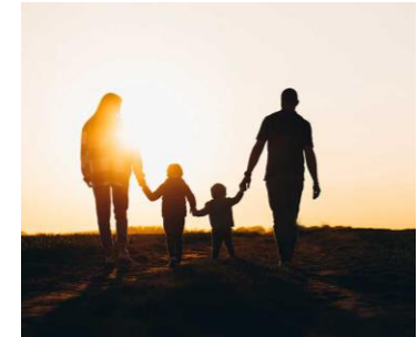
Fatality Management Services