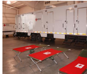
Mass Care Services