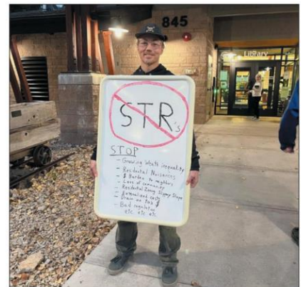
PROVIDED / ALEX TSIGDINOS