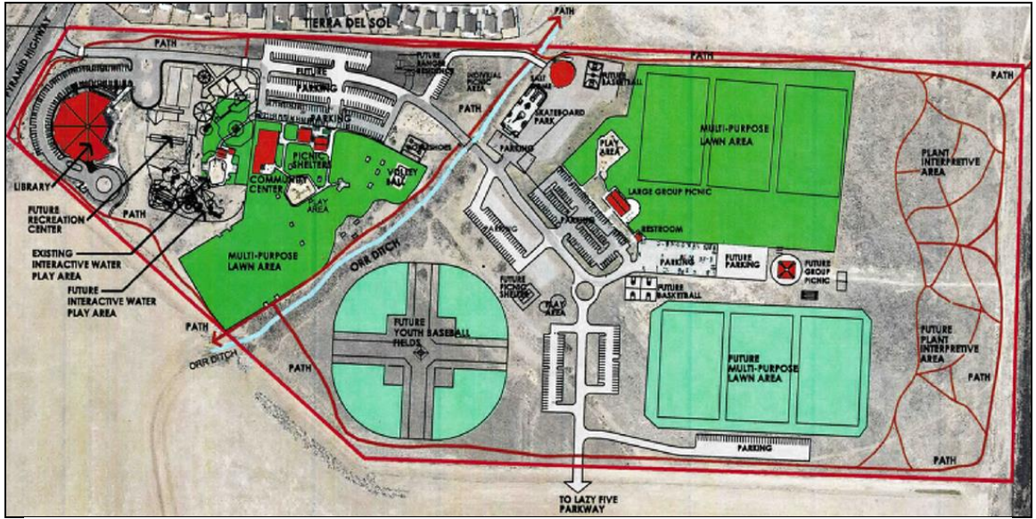
Exhibit 3 – Lazy 5 Regional Park Master Plan showing a proposed trail along the northern park boundary