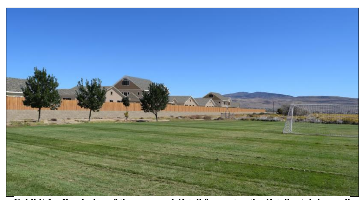
Exhibit 1 – Rendering of the approved 6'-tall fence atop the 6'-tall retaining wall

In lieu of paying for the appraised value of the easement area, Toll is proposing to mitigate impacts associated with the project by installing and maintaining park landscaping and constructing a trail within the park, in conformance with the Lazy 5 Regional Park Master Plan. An appraisal was conducted and determined that the value of the permanent easement area is $45,675.00 and the value of the temporary construction easement area is $54,907.00, for a total of $100,582.00. However, Washoe County Regional Parks and Open Space does not typically require payment for temporary easements. Toll estimates that the cost for the landscaping and irrigation on the slope will be approximately $6/sf or $78,102.00 and that the cost for the trail will be approximately $13,080.00. Given that the cost of the park improvements well-exceeds the appraised value of the permanent easement, staff is supportive of the proposed mitigation measures in lieu of payment.